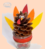
Turkey Candy Jar